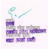
Signature of the Employer with seal

21. The Establishment, Apprentice/Guardian hereby also declares to comply with the terms and conditions of National Apprenticeship Promotion Scheme (NAPS),if applicable.